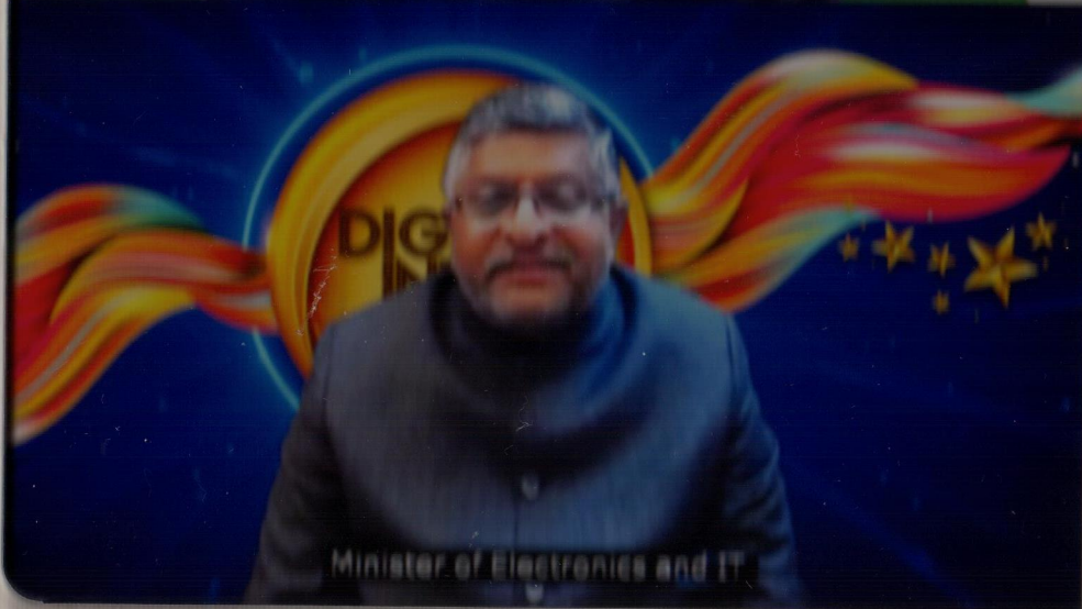
Minister of Electronics and IT